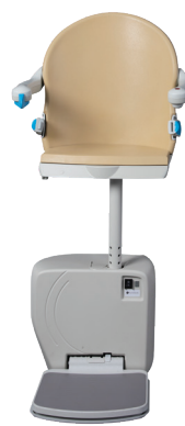
Smart Perch Seat